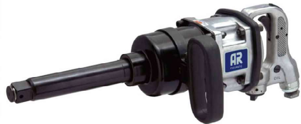
AR-2035TL 1" DR. AIR IMPACT WRENCH W/6" ANVIL