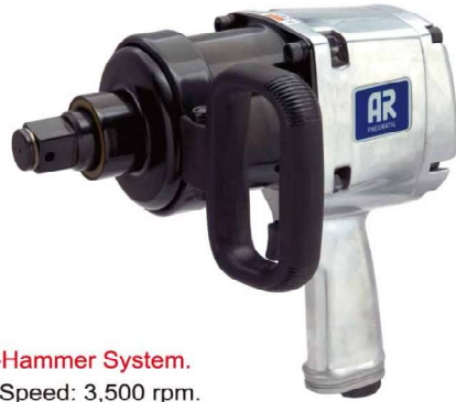
AR-2038T 1" DR. AIR IMPACT WRENCH