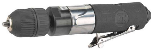
AR-1505B 3/8" DR. STRAIGHT AIR DRILL