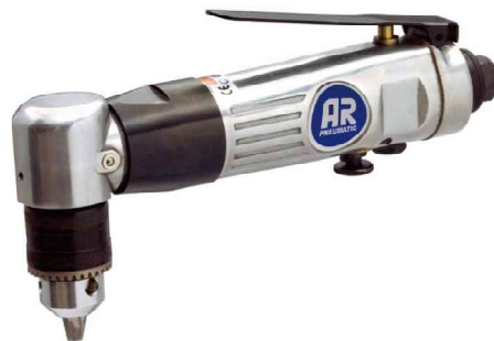
AR-3007 3/8" DR. REVERSIBLE AIR ANGLE DRILL