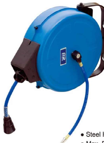
AR-8514C AIR HOSE REEL - 9.5mm x 13.5mm (dia) x 12mL.