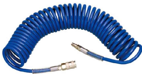
AR-8506BC PU RE-COIL AIR HOSE - 8mm x 12mm (dia.) x 15mL.