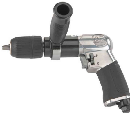
AR-1513B 1/2" DR. REVERSIBLE AIR DRILL