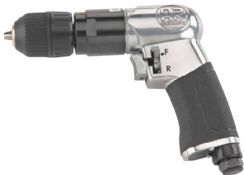
AR-1511B 3/8" DR. REVERSIBLE AIR DRILL