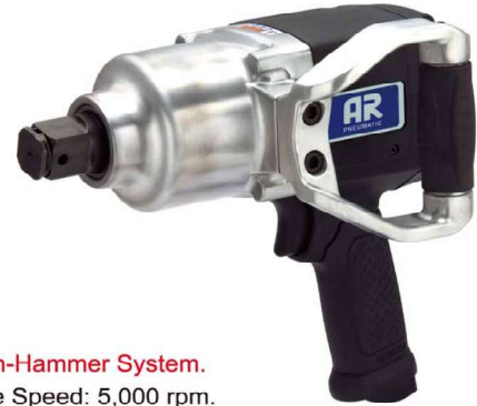
AR-9535T 1" DR. AIR IMPACT WRENCH